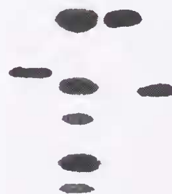
Figure 2. Native gel electrophoresis of crude hemolysates and purified FPLC fractions of Hemipholis elongata hemoglobin. Samples were run on a 10% acrylamide gel with pH 8.3 electrophoresis buffer and stained with Coomassie blue. A low-porosity stacking gel (upper fraction) was used to sharpen the banding pattern. Lack of banding in lane 5 is attributed to low concentration applied to the gel, since mass spectrometry results showed fraction 3 to contain hemoglobin. Lane 1: Human hemoglobin A; lane 2: Crude hemolysate; lane 3: FPLC fraction 1; lane 4: FPLC fraction 2; lane 5: FPLC fraction 3.

The hemoglobin of juveniles (disc diameter 0.48 to 0.8 mm) has a higher affinity ( P_{50} = 2.3 mmHg in cellulo and 4.0 mmHg in tube feet of intact animals, pH 8.0 at 20 °C) for oxygen than the adult hemoglobin ( P_{50} = 11.4 mmHg, disc diameter 5 to 12 mm) (see Table 1). This was true for both isolated RBCs and intact animal measurements. The greater apparent P_{50} for measurements using intact animals may be explained by oxygen consumption of the animal. The P_{O_2} within the tissues is lower than the external P_{O_2} due to oxygen consumption by the tissues. The difference in P_{O_2} can lead to an overestimation of the P_{50} . Even with the